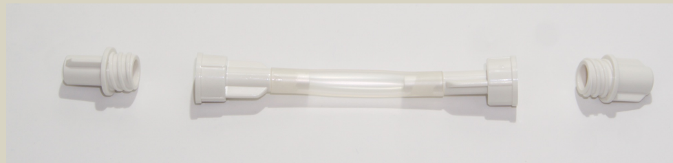
DPT6720 - Port Female-to-Female Connector

Order: +1 844-323-9397 Product Info: +1 847-909-4298 +1 312-544-9691