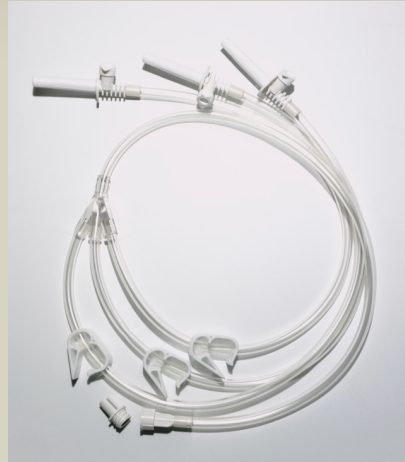
DPT1133 - 36" 3-Lead Male Connector Set with Vented Spikes

Manufactured by Douglas Medical Products, Inc., IL, USA