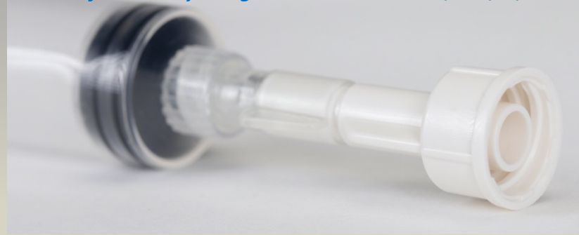
DPT6820 – Port Male-to-Female Connector

Manufactured by Douglas Medical Products, Inc., IL, USA